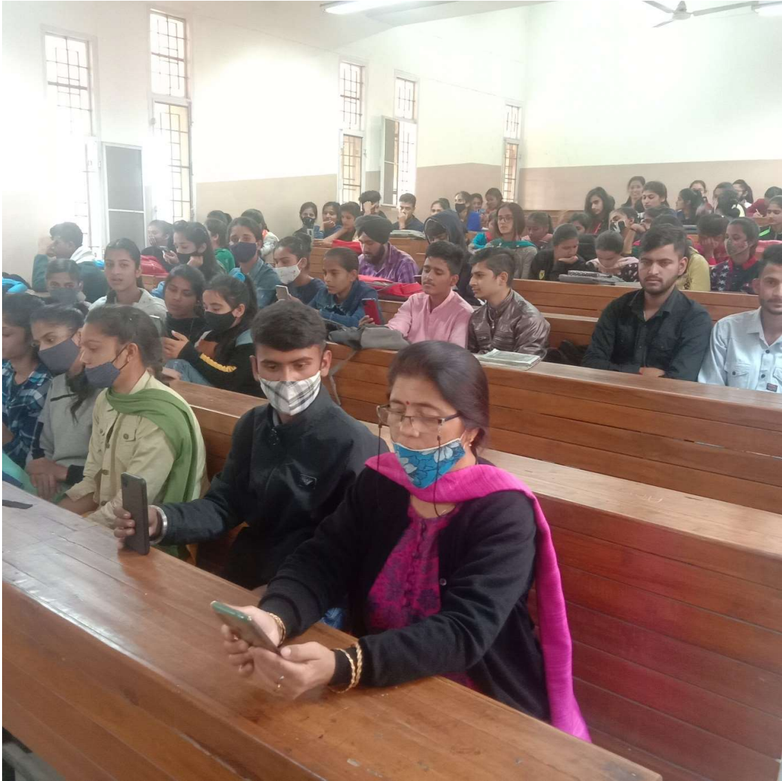
Photograph 3 students attending online webinar